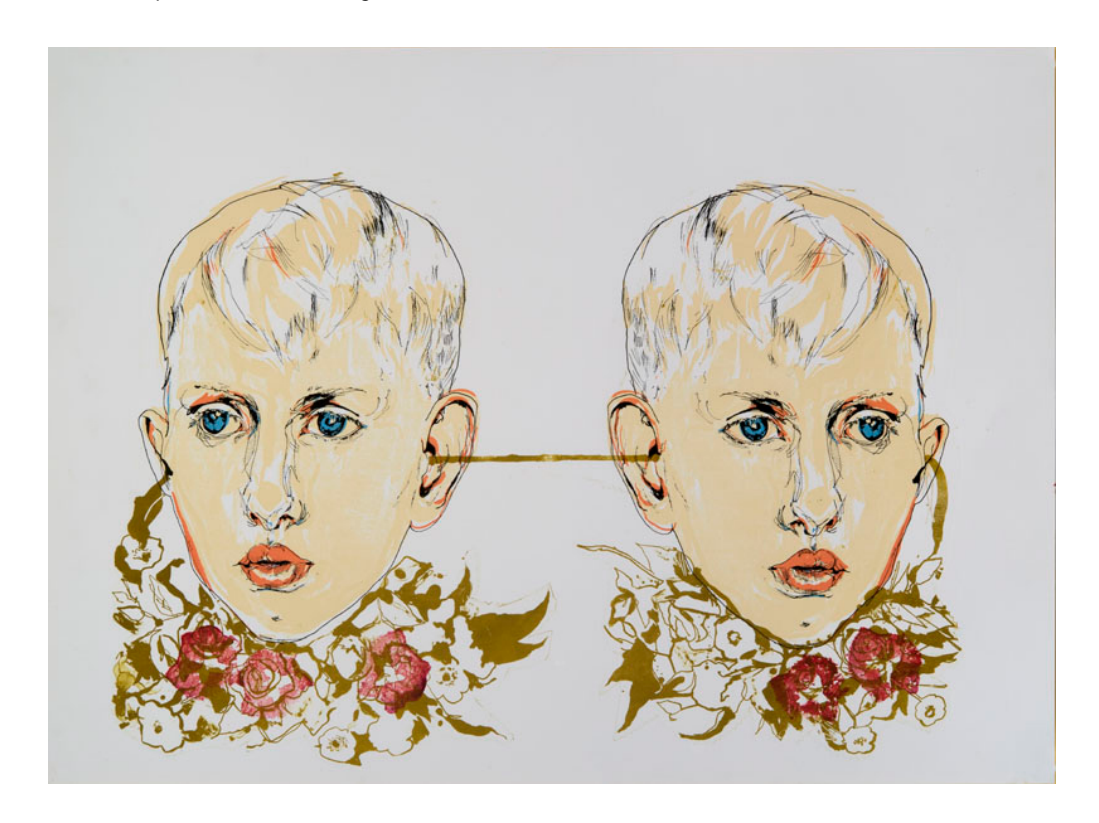
@CiderGallery (https://twitter.com/cidergallery) Fine Art Facebook Page (https://www.facebook.com/cidergalleryfineart) Offices Facebook Page (https://www.facebook.com/CiderGalleryOffices) Events Facebook Page (https://www.facebook.com/cidergalleryevent)

©2013 Cider Gallery. All rights reserved. Website design and development services by Philsquare (http://philsquare.com).